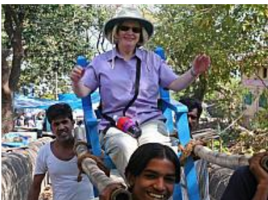
Carried 125 Steps

After our ferry ride we visited the Taj Hotel. This is an old hotel built in 1903 with a great deal of character and is very luxurious. It is the highest rated hotel in Mumbai. It is very large with 12 different food outlets, 565 rooms and many huge suites. We saw quite a few rooms and the hotel is beautifully maintained. The hotel has a perfect location right on the harbor across from the "Gateway of India" the principal landmark of Mumbai that was built to commemorate King George V's visit to the colony in 1911. We ate lunch here, not quite as exciting for me as it was an Indian meal and as one that does not even use pepper I was concerned about this due to the spices. However, I had Ken, the official food taster, taste it for me and it was not as spicy as I had anticipated it would be. By taking off most the sauce, I was able to get through the meal but Indian food is not my "cup of tea". I think this is my one and only Indian meal. However, everyone else in the group really enjoyed the food.