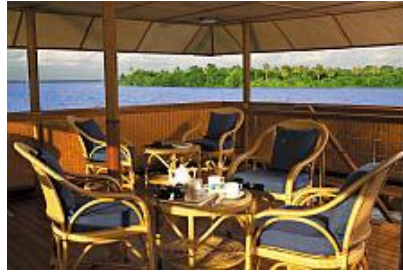
Deck Lounge Area