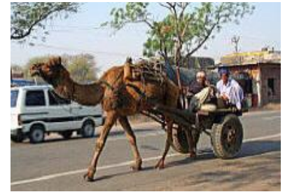
Camels on the Road