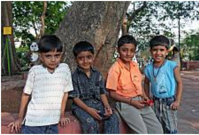
Kids at the Park

The city has some incredible architecture, it does need cleaning up but the buildings are quite remarkable. Most were built in the late 1800's to the early 1900's. The key items of interest were the Gateway to India, a triumphal arch built to commemorate the visit of George V and Queen Mary, and the incredible central Railway station which is a huge building with amazing details. As with all major cities, there are many churches, temples, and places of interest. I enjoyed with a sitting at the children's park and watched group of ladies in their brightly colored saris sitting with their children. The Marine drive winds around the sea coast and at night you can see the view of "Queen Victoria's Necklace" and by day a panorama of Mumbai's skyline.