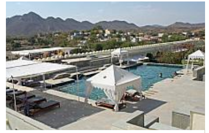
Delightful Pool Area