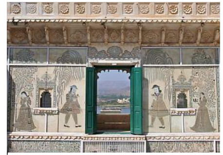
The Inside of the Grand Palace

Arriving in Udaipur, we were transferred to a boat for the final leg of our journey. In front of us, was a magical scene with the Taj Lake Palace and the Grand Palace all lit up in the middle of the lake like a massive palace that appeared to be floating in the sky as it reflected against the moonlit (full moon) water. As we came closer to the hotel we were going to be staying at, the Oberoi Udaivillas Hotel , they stopped the boat and a fireworks display took place. There must have been about 20 rockets and it was spectacular. Then, we stepped off the boat into the most incredible property that I have ever seen. Contemporary and Indian at the same time, with water everywhere and tons of space.