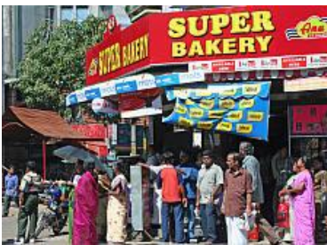
Bakery in Periyar

The only way into Periyar is to drive. The ride from the Cochin to Periyar was interesting. The roads are narrow and the traffic is heavy. You must trust in your driver as everyone honks and passes in areas where you are sure there is not enough room. Somehow it all seems to work and you arrive safely at your destination. We all thought we would nap but none of us did. The sights of India are unique. So many wild ducks and stretches of green vines with purple flowers. Just like in a post card. The rubber plantations and the tea plantations were beautiful. Particularly the tea plantations, I had never seen a tea plantation before. The tea plantations are a brilliant shade of green and are terraced on the hillsides. looked like you could bounce from plant to plant, a truly spectacular sight. This area is very Christian and so there are many fantastic churches on the way. Then there are the little towns, just full of people, and tiny little shops. India is dirty there is no getting around this fact but it is amazing the longer you are here the more you get used to that.