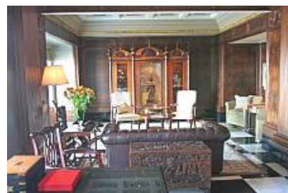
A Delightful Sitting Area