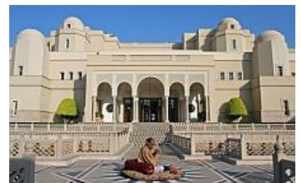
The Oberoi Amarvilas