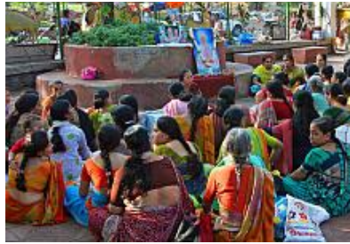
Mom's Watching Kids