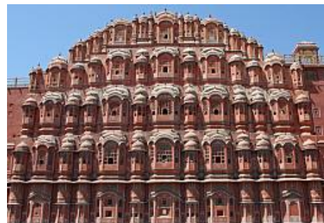
The Palace of the Winds

Jaipur is considered part of the golden triangle and is visited by most tourists to India. At first the town is not that appealing. However, after a few days seeing the sights of Jaipur it is clear why this town is visited by most tourists.