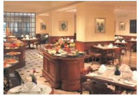
Casual Dining Area