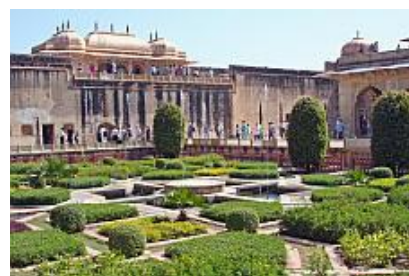
Amber Palace Courtyard