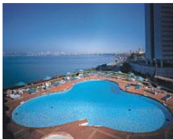
The Pool and Ocean