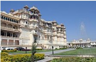
Grand Palace Courtyard

We went on a tour of the Grand Palace. This was a very interesting palace and I enjoyed our visit here. Each area offered something new to see and the beauty of detail work on the walls was incredible. We stopped at a store called Anoke that a lady in the hotel had told me about. Great clothes, I bought one outfit.