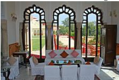
Delightful Sitting Area

The foyer and public rooms are lavish and feature many extraordinary pieces of art, sculpture, and very unique furnishings. The hotel offers a variety of dining options with some unique night time experiences. Suvarna Mahal is the grand Indian dining experience. For more casual fare, the open-air Verandah Cafe on the palace lawn is always popular as is the casual dining room, the Rajput Room. Steam is a very popular restaurant/bar experience within a restored steam engine and a Victorian style station