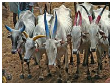
Cow Sale on Road