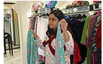
Shopping At Anoke

We went to lunch at a hotel called Devi Garh by lebua . This hotel was an old refurbished fort with the local villagers actually providing most of the labor. This hotel has revitalized this little town and all the staff, waiters, and housemaids are local. The contrast of the old historic building with the highly contemporary large bedrooms works so well. The hotels and are really amazing in Udaipur and below are pictures from each one we visited.