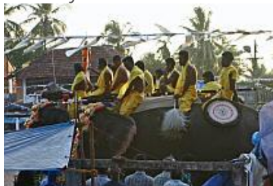
Local Temple Celebration