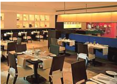
Casual Dining at Tiffin