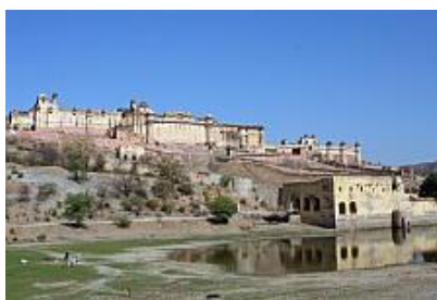
The Fort & Amber Palace