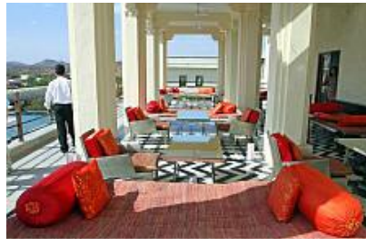
Patio Bar Area