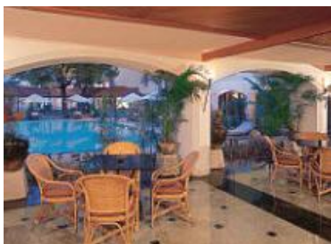
Pool Dining Area