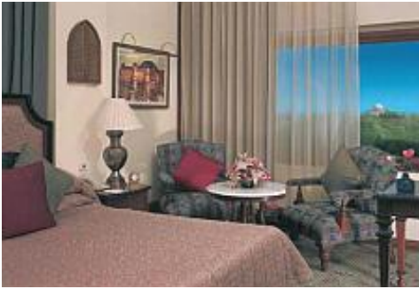
Standard Guest Room

The hotel is well suited for a business or leisure property. The hotel is located close to the city center which is the business, commercial and shopping districts. The luxury hotel overlooks Delhi's prestigious Golf Club on one side and the heritage site of Humayun's Tomb on the other.