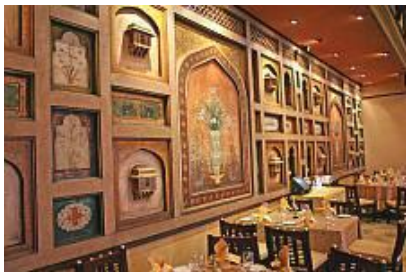
Varq - Indian Restaurant

The bars, lounges and restaurants are beautiful and tastefully decorated. This is a large hotel featuring many different lounges and restaurants. The cuisine offered is varied. Indian cuisine is featured in the fine dining restaurant as well as an excellent Chinese restaurant. The spa incorporates a large area and has really unique treatment rooms, there is a full beauty shop and a huge gym with every type of machine imaginable.