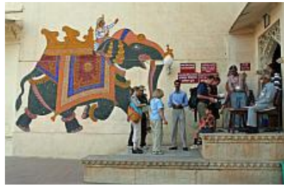
Grand Palace Entrance