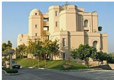
View upon arrival