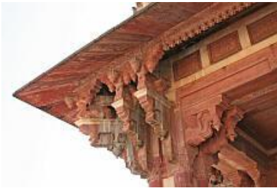
The Pink City

The observatory is interesting with the largest sundial in the world that keeps time to two seconds. It is quite fascinating. The Palace museums are housed in part of the city Palace and there are three museums. They are not large. These have items from the Maharajas of this region. One has clothing, one has weapons, and the third has paintings, rugs and howdah's (elephant saddles for carrying people). The current Maharaja still lives in this complex.