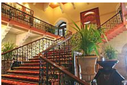
Stairway To Rooms

The foyer and public rooms are lavish and feature many unique pieces of art, sculpture and very unique furnishings. The outdoor patio and dining area pictured below is in front of the courtyard with a pool and is a wonderful place to sit and relax. There are 9 different venues for food featuring many different types of cuisines.