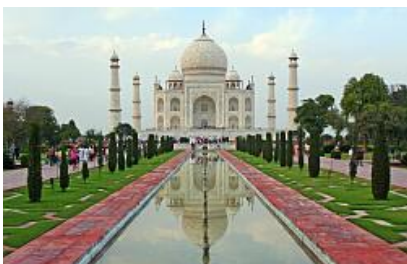
Taj Mahal at Agra

The south of India offers the bustling port city of Mumbai (Bombay) , the new beach resort of Goa, very popular with Europeans, Kochi (Cochin) and the amazing Kathakali performance, the beautiful Kerala Backwaters , Lake Periyar and the surrounding spice villages. This is a less touristy area of India and the state of Kerala has the highest literacy rate in India. This perfect as an extension to a Northern tour or for a second visit to India.