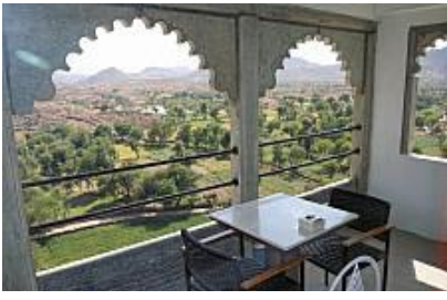
Table With a View

This is an incredible building with some of the old murals still decorating the walls as shown in the picture. The dining room offers spectacular views of the surrounding countryside that is truly so beautiful it does not look real. The food was really good, we had a rack of lamb that was outstanding. The pool area, the lounging bar and many of the public rooms are really remarkable and focus on various precious metals. There are small private dining areas where you can have an incredible meal and be treated like a Maharaja.