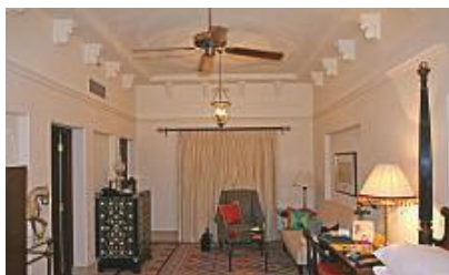
Bedroom Living Area