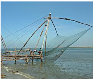
Chinese Fishing Nets

These attractions are featured on a local city tour. The most interesting are the murals at the Dutch Palace.