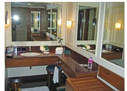
Bathroom Vanity area