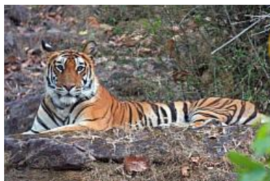
Bandhavgarh National Park