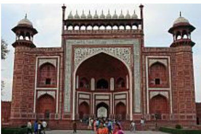
Taj Mahal Entrance

The inside is not very large and your guide will explain the two tombs and show you the places to look to see the exquisite workmanship up close.