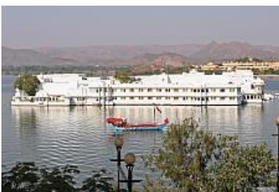
Taj Lake Palace

We went to lunch at a hotel called Devi Garh by lebua . This hotel was an old refurbished fort with the local villagers actually providing most of the labor. This hotel has revitalized this little town and all the staff, waiters, and housemaids are local. The contrast of the old historic building with the highly contemporary large bedrooms works so well. The hotels and are really amazing in Udaipur and below are pictures from each one we visited.