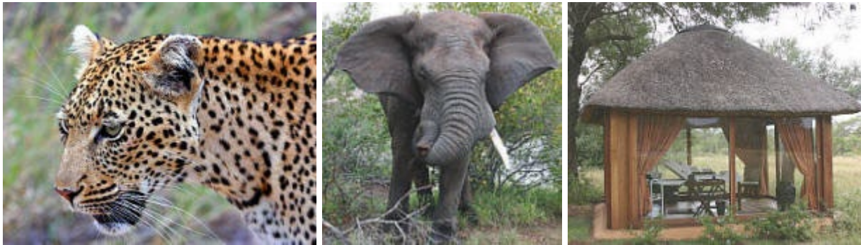
Leopard and Elephant Pictures taken by Keene Luxury Travel at Kings Camp

This is a property that we highly recommend as an excellent value. In our opinion, the rates are lower than they should be for a property of this caliber. This beautiful property is a sister property to Leopard Hills. These are "Seasons in Africa" properties in two prime game viewing areas in South Africa.